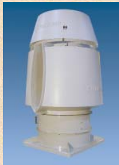
This Tri-Stack TS-3 roof exhaust fan incorporates an integral acoustical silencer nozzle for highest attenuation in particularly noise sensitive areas.